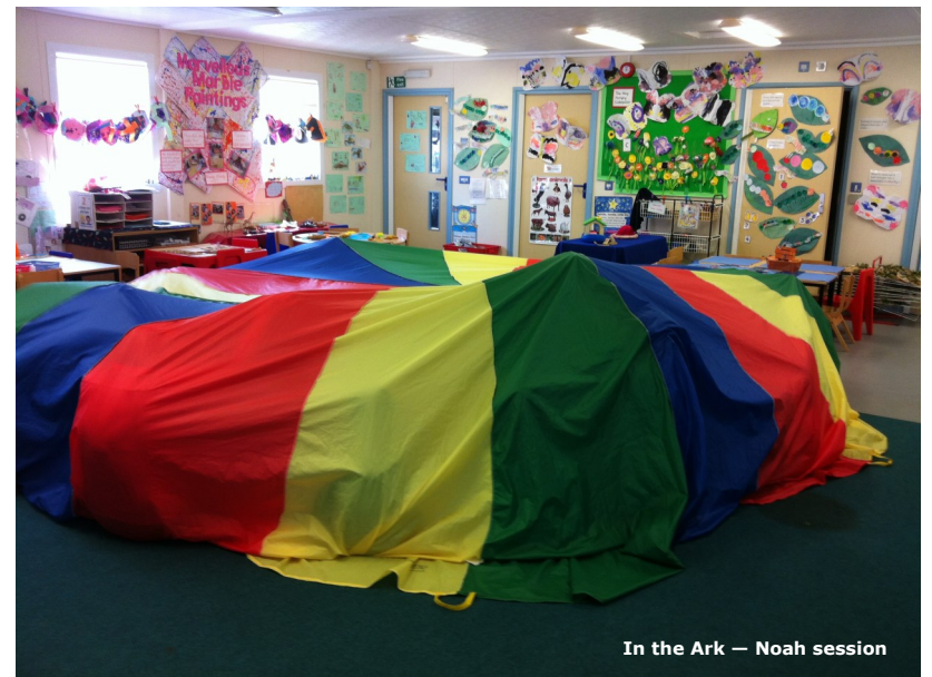
In the Ark – Noah session