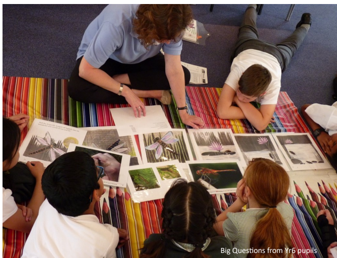
Big Questions from Yr6 pupils