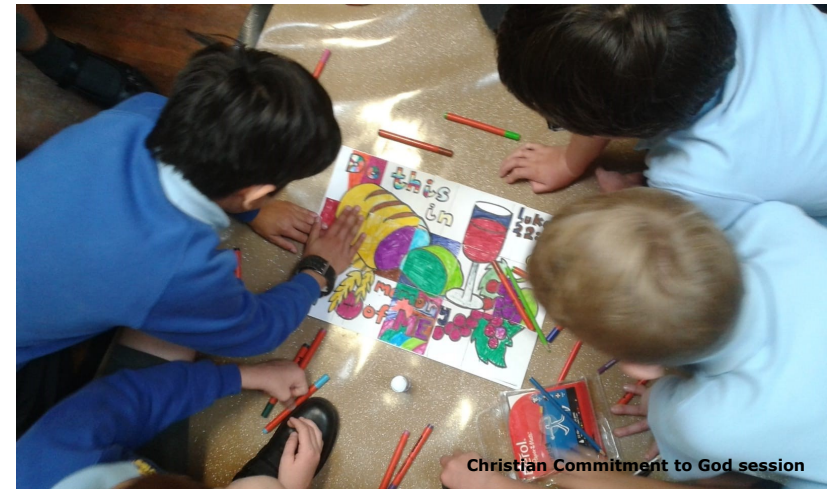
Christian Commitment to God session